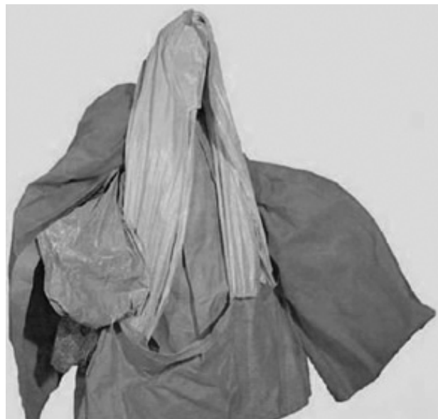
Figure 1. Helio Oiticica's Parangolé 1985.

readymades where art objects are deconstructed, there is a proliferation of meanings that do not reside inside art objects, but in the world they refer to.